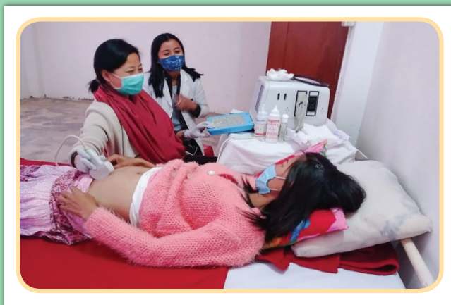
Quality ANC Check-up free Ultrasonography test under PMSMA