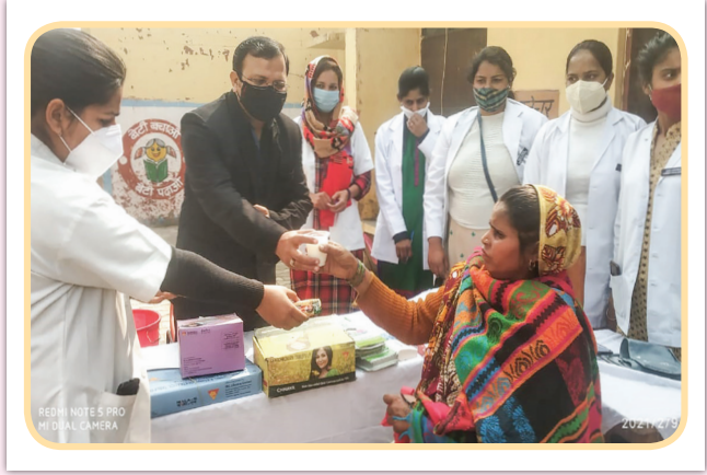
Counseling session under PMSMA